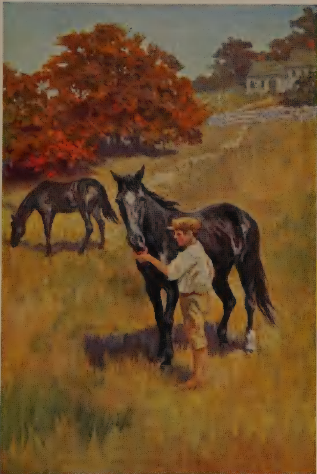
THERE WAS NOT A DAY WHEN HE DID NOT PAY ME A VISIT